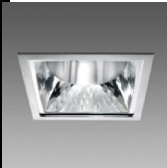
Clear diffuser - office 7/8