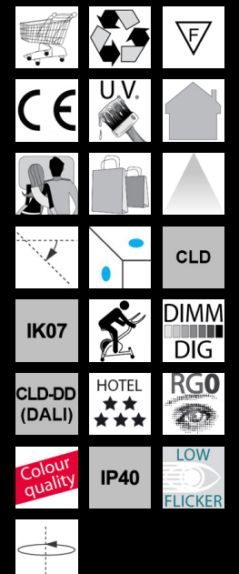
Download DXF 2D fashionr5.dxf Montaggi - FASHION REV3.pdf